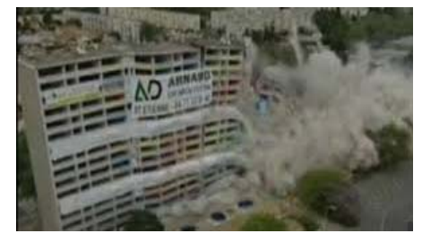
Renewal to be completed in 2016