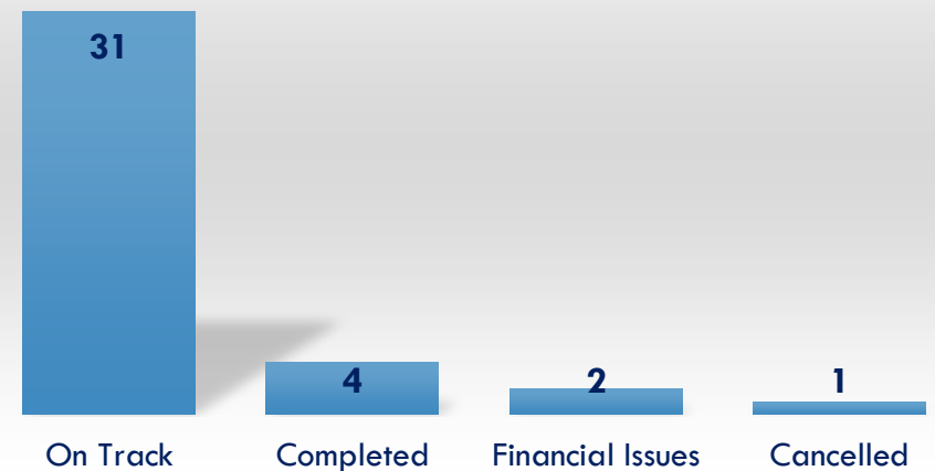
Overall status reported through the VC Registry