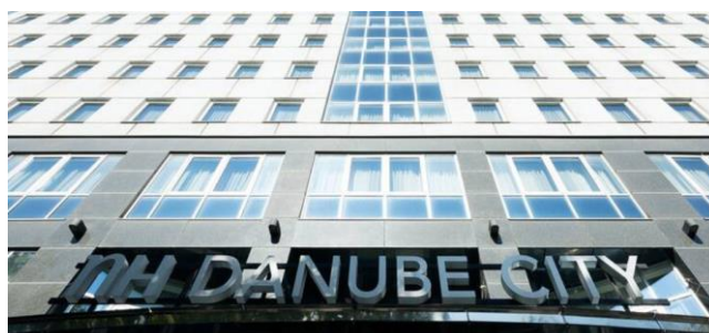
© 2000-2019 NH Hotel Group Santa Engracia 120. 28003 Madrid, Spanien

Wagramer Straße 21 1220 Vienna T +43 12 67 59 72 (Reservation) F +43 1 260 200 E nhdanubecity@nh-hotels.com W https://www.nh-hotels.com/