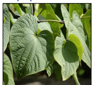
Kava Plant -piper methysticum

The Yaqona or Kava (piper methysticum) is a plant shrub native to most of the islands in the Pacific. The root and stems are pounded, mixed with water and made into a, non-alcoholic beverage that has been used socially and ceremonially in that part of world for hundreds of years<sup>3</sup>.