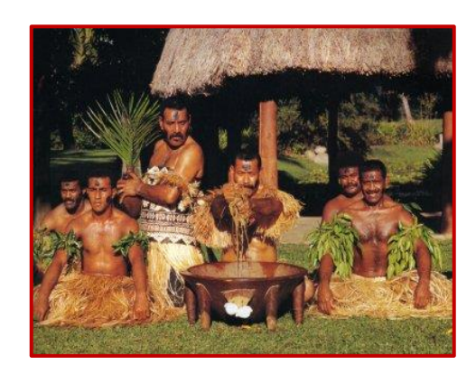
Mixing of Kava