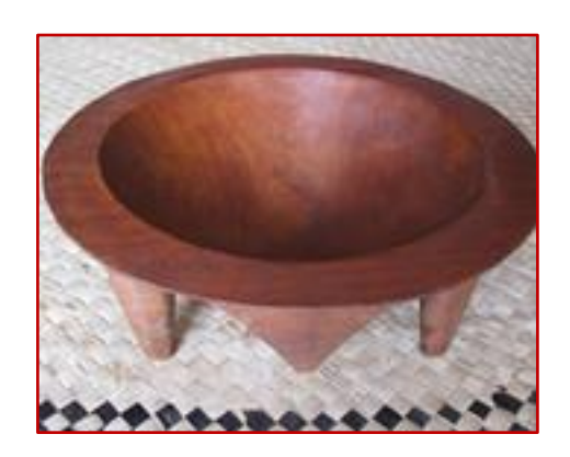
Tanoa- Kava Bowl