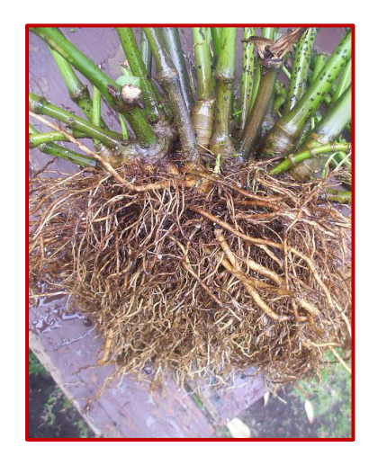
Green Kava & Roots