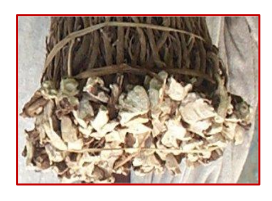
Dried Kava Roots