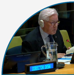
H.E. Mr. Bob Rae