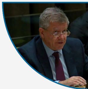
Mr. Guy Bernard Ryder