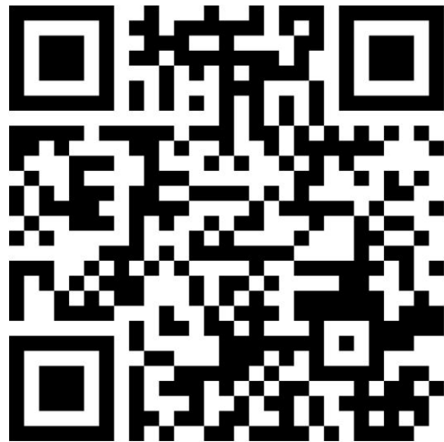
QR Code for Session 4