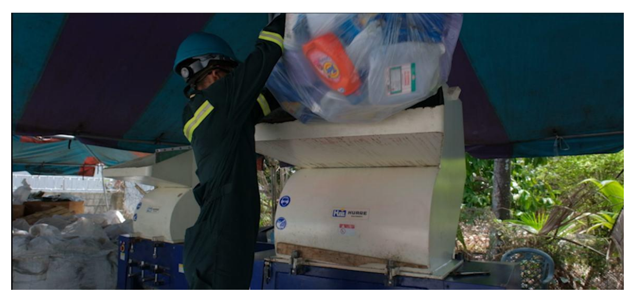
Plastic waste is shredded before being turned into lumber at a factory in Arima, Trinidad.