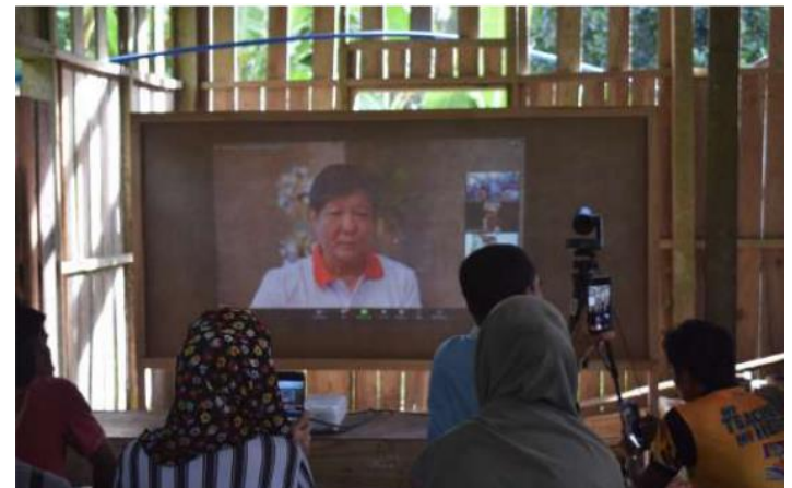
Data source: DICT R9 BASULTA

The event served as an excellent opportunity to assess the effectiveness of the program and gather feedback from the beneficiaries.