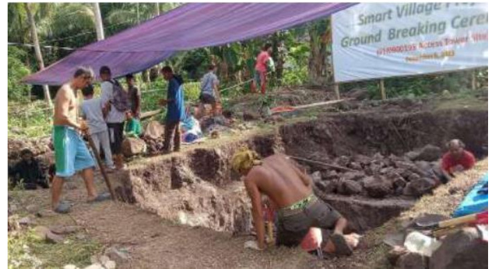
Data source: Ustadz Idris Ijam

Telemedicine Launching. Telemedicine stands out as a crucial service aimed at addressing one of the primary needs identified within the community of Sacol Island during the comprehensive needs assessment. This aims to improve the healthcare services provided to the residents of Sacol Island.