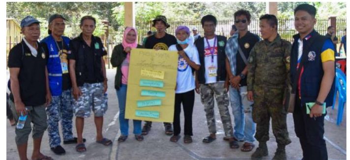
Figure 5. Sacol Island residents present their needs and priorities during the needs assessments conducted in June 3, 2023

This activity identified gaps between current conditions and desired outcomes, enabling stakeholders to decide where it can contribute that is aligned with their objectives. The result of the needs assessment allowed the DICT to identify the partners needed to work together on the Sacol Island Smart Village initiative.