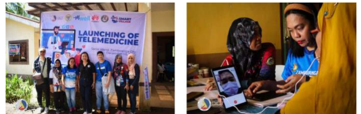
Data source: DICT R9 BASULTA

Huawei Philippines and mWell donated an mWell on-the-go bag for the Sacol Island Community to roll out the mWell online integrated health and wellness platform. The platform provides health services like Teleconsultation, Reading of Lab Results, Prescription of Medicine, and Diagnosis to augment the Health Services provided to the people of Sacol Island.