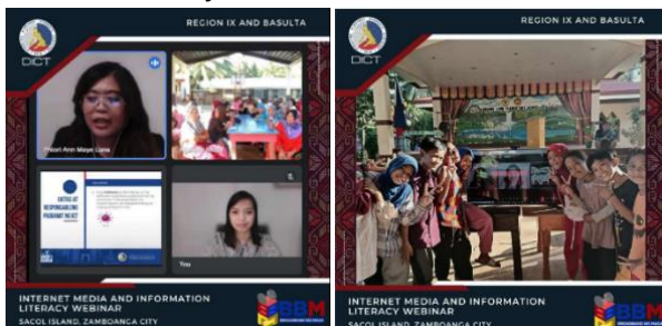
Data source: DICT R9 BASULTA

Students, parents, and school staff of Landang Laum Elementary School gathered at a multipurpose hall to engage with trainers from Zamboanga City via live Zoom Conference. Aside from basic digital literacy, the training also focused on Cybersecurity to keep the people of Sacol safe as they navigate the virtual world.