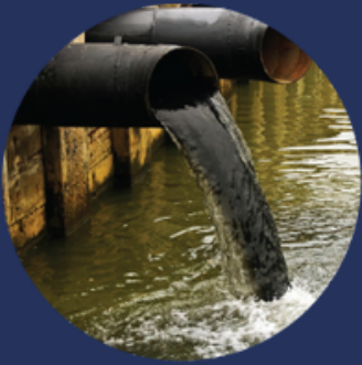
Water pollution and waste management