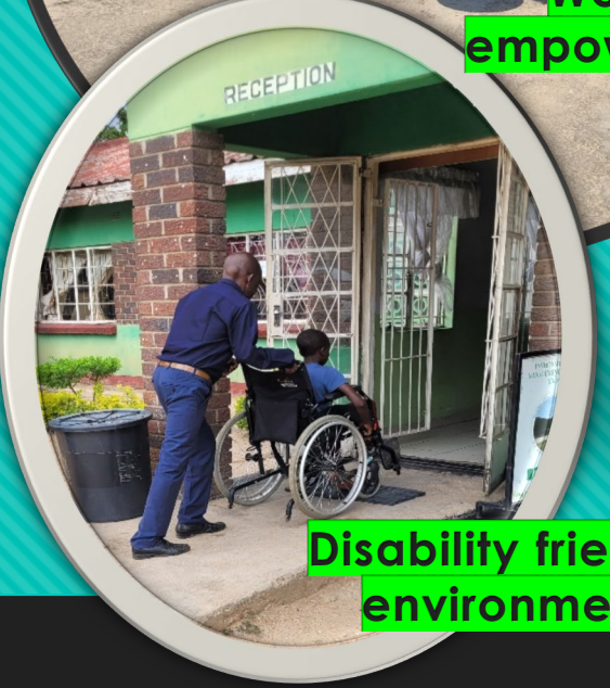
Disability friendly environment