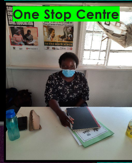
One Stop Centre