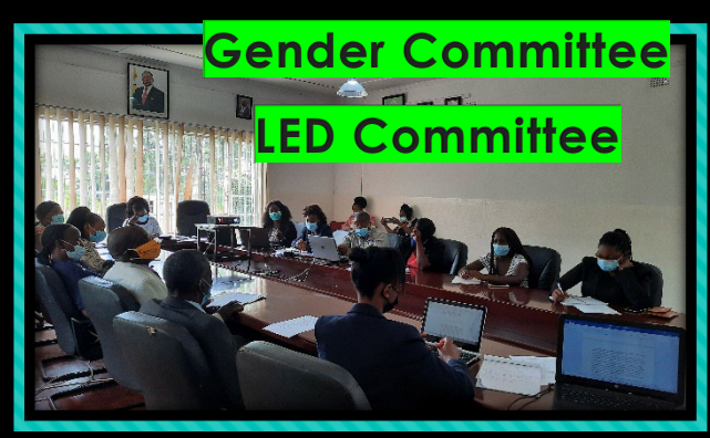
Gender Committee LED Committee