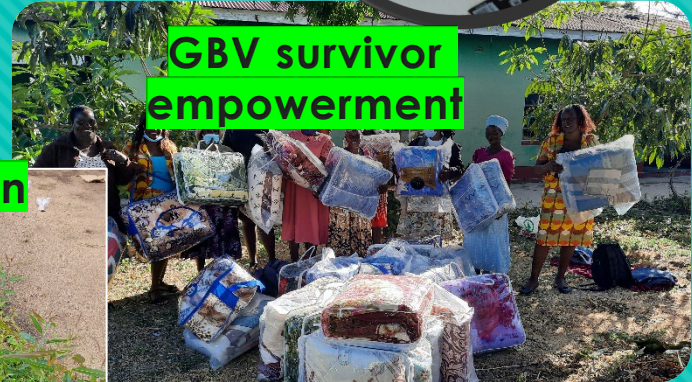
GBV survivor empowerment