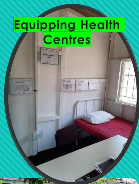
Equipping Health Centres