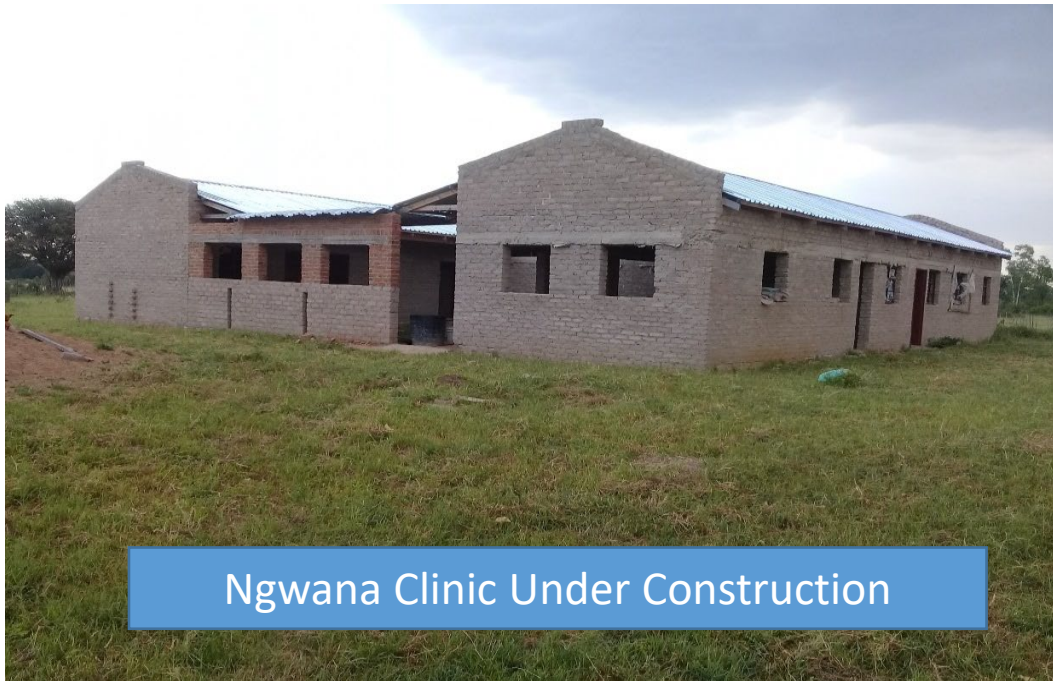
Ngwana Clinic Under Construction