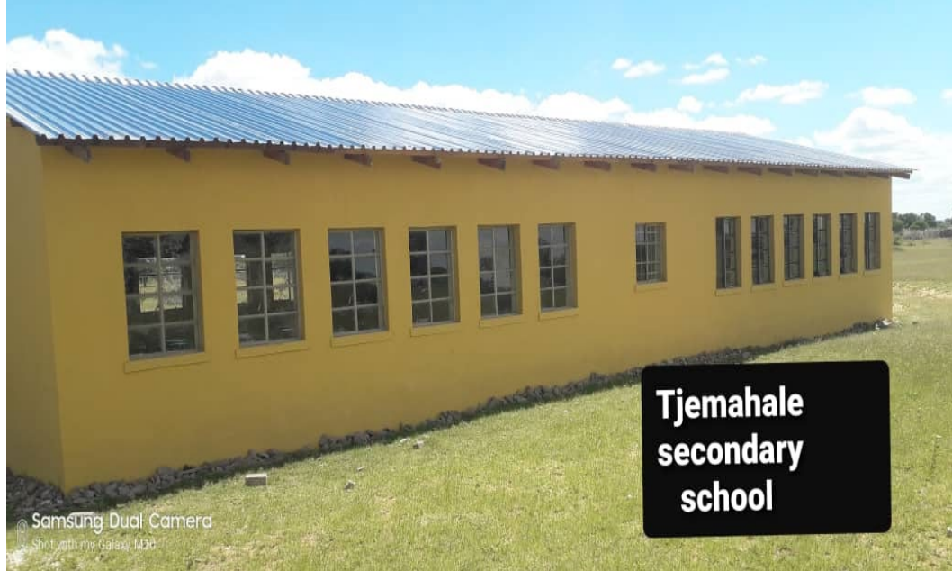
Tjemahale secondary school

Samsung Dual Camera Shot with my Galaxy A30