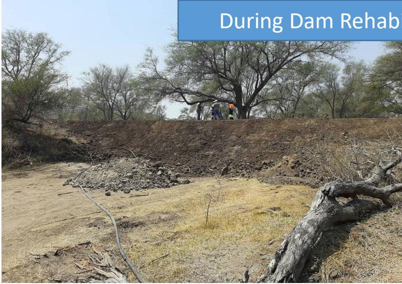
During Dam Rehabilitation