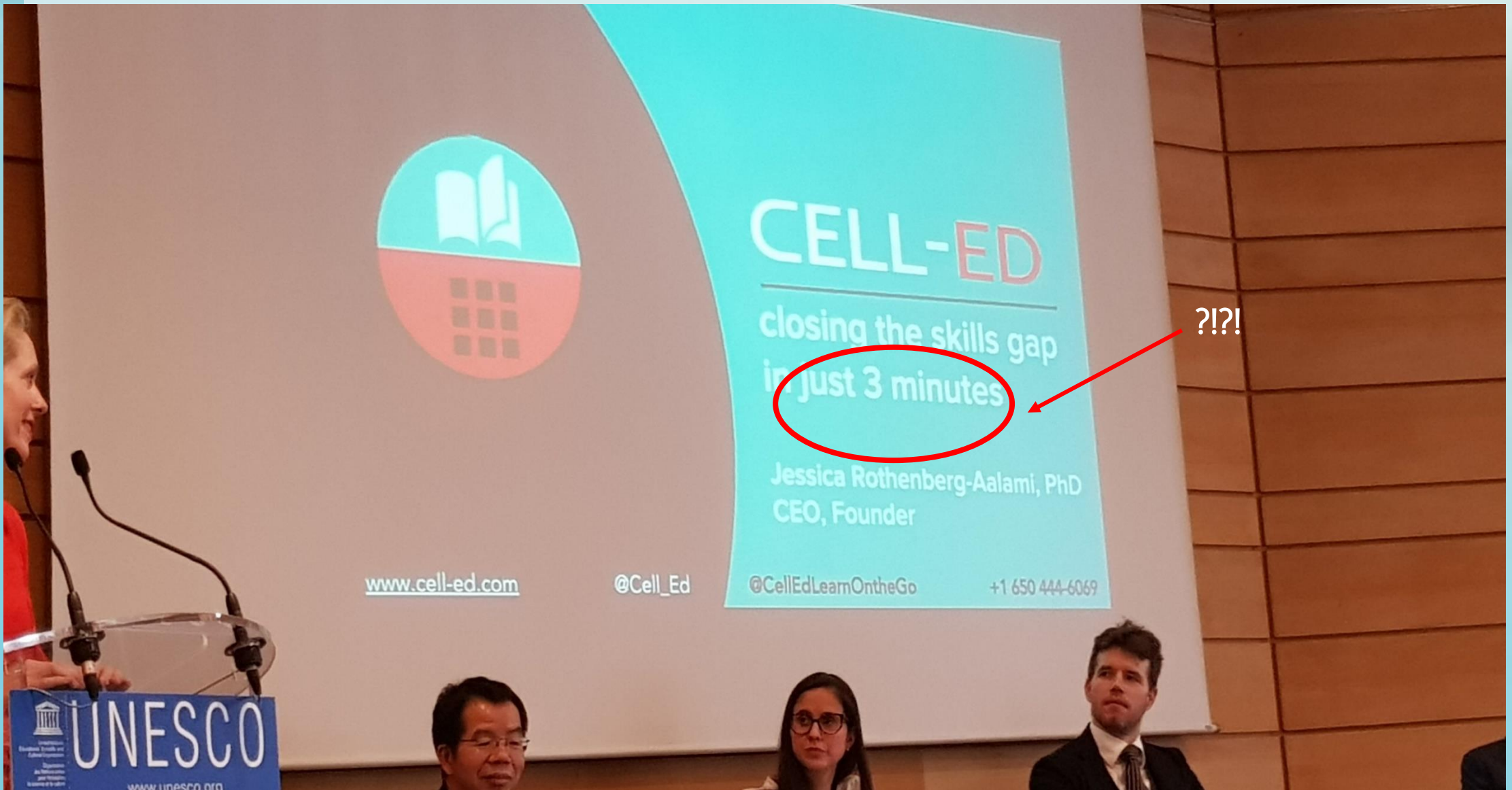
International literacy day 2018 and literacy skills