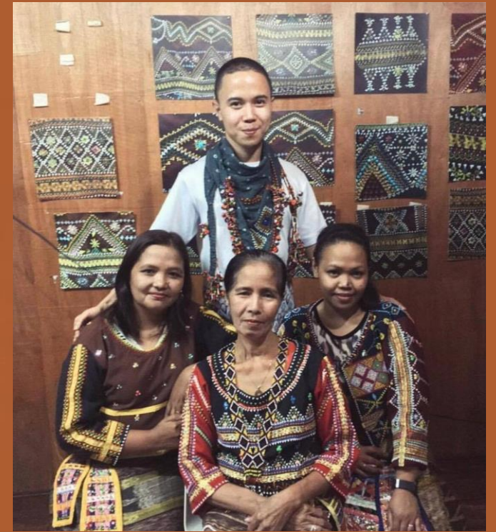
The Bagobo Tagabawa Community in Lubugan, Toril Davao City