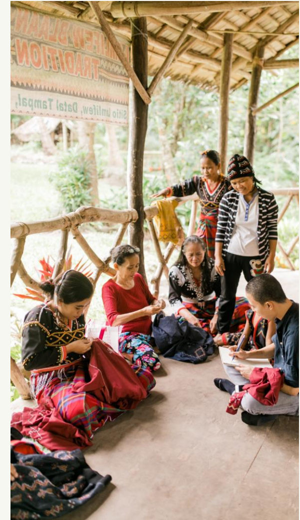
Blaan Community of Lamlifew, Malungon in Sarangani Province