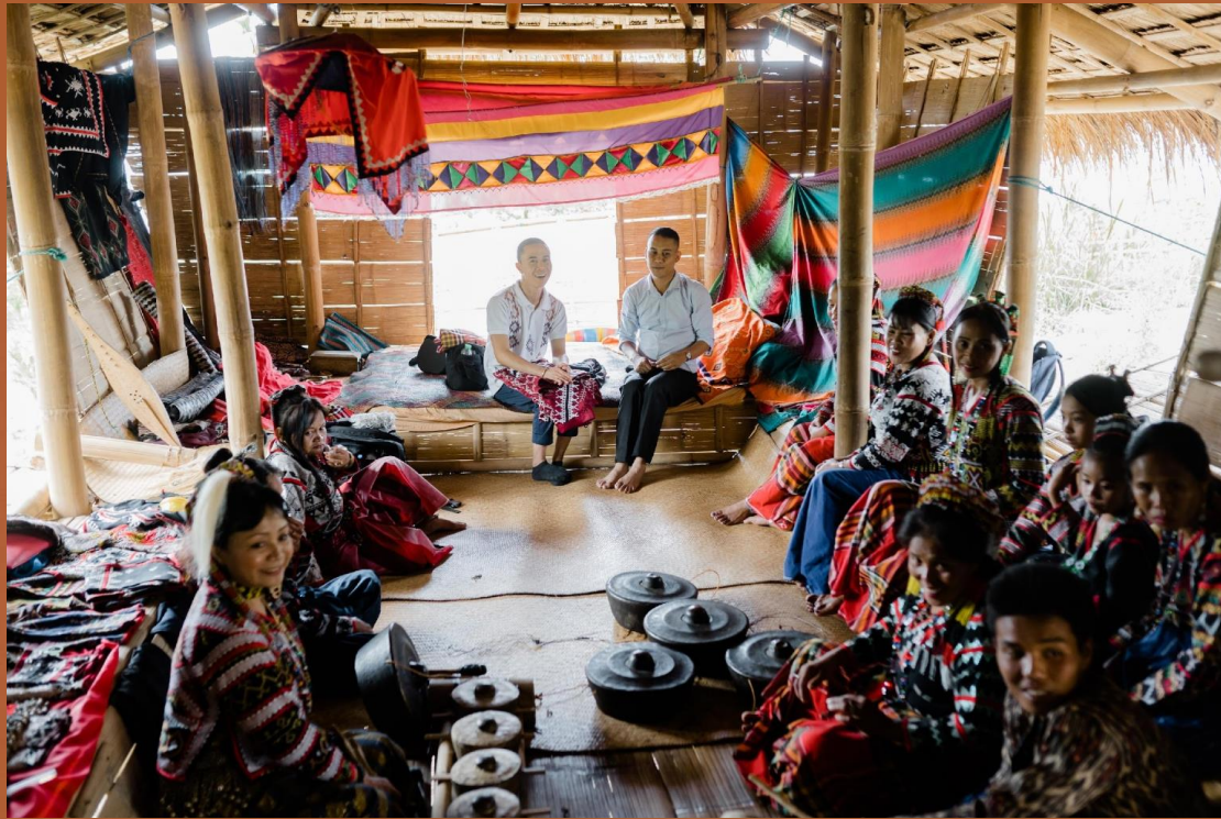
Tboli Community of Lake Sebu, South Cotabato