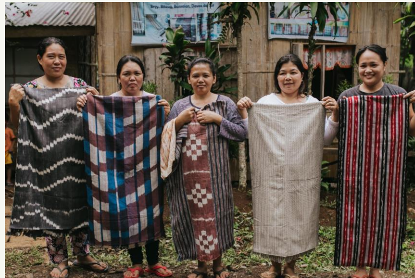
Bagobo Tagabawa artisans in Bitaug, Bansalan Davao del Sur

NIñOFRANCO has built long-term partnerships with different ethno-linguistic communities in Mindanao.