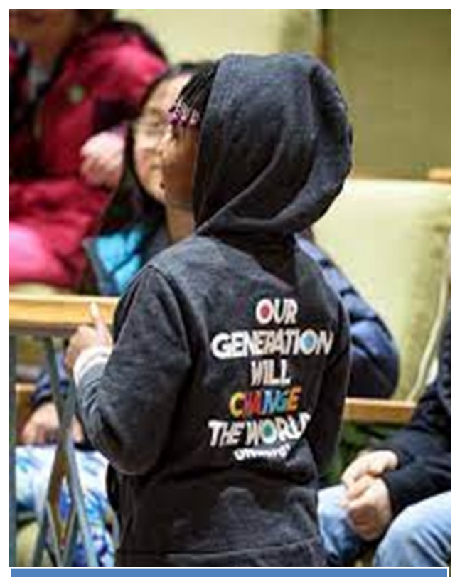
UN Photo/Loey Felipe, UNDESA and UNITAR, Stakeholder Engagement Practice Guide

^{*} In our breakout groups this morning, you will be asked to consider and identify the stakeholders in your local context whose participation will be important in the VLR process ^{*}