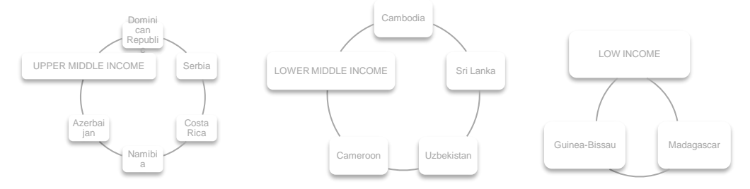
Fig.4. Created by the consultant. 13

The review, finally, considered that, besides the civic space situation, the territorial size, the population, and countries' income matter and should be taken into consideration when developing multi-country projects, including in relation to the budget allocation for each country.<sup>12</sup>