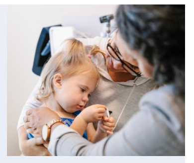
Click here for more

Impact investing is one of Merck's core approaches to advancing sustainable global health systems and achieving the SDGs. Through impact investing, Merck can deploy financial resources in ways that may generate not only improved access to healthcare for underserved populations but also commercial opportunities—all while growing a sustainable global health ecosystem and attracting additional capital and partners.