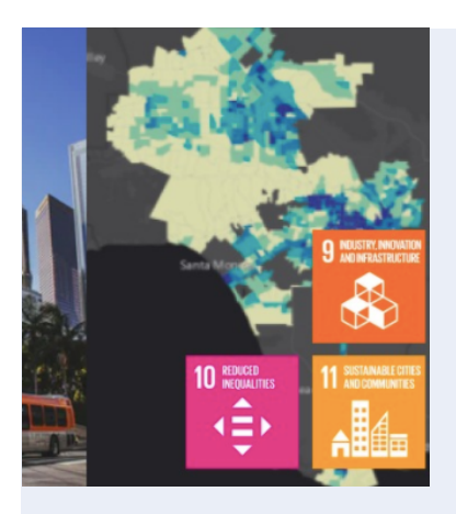
Click here for more