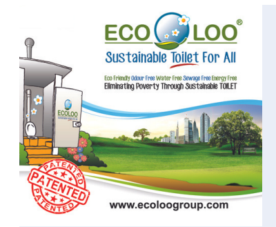
Click here for more