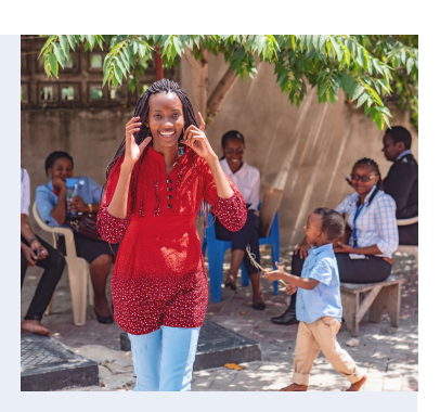
Click here for more

The EU External Investment Plan (EIP) is helping to generate jobs, growth, and prosperity in countries neighboring the EU and in Africa. A major component of the Plan is the European Fund for Sustainable Development, which aims in its founding regulation to support investments primarily in Africa and the Union's Neighbourhood as a means to contribute to the achievement of the SDGs, in particular poverty eradication.