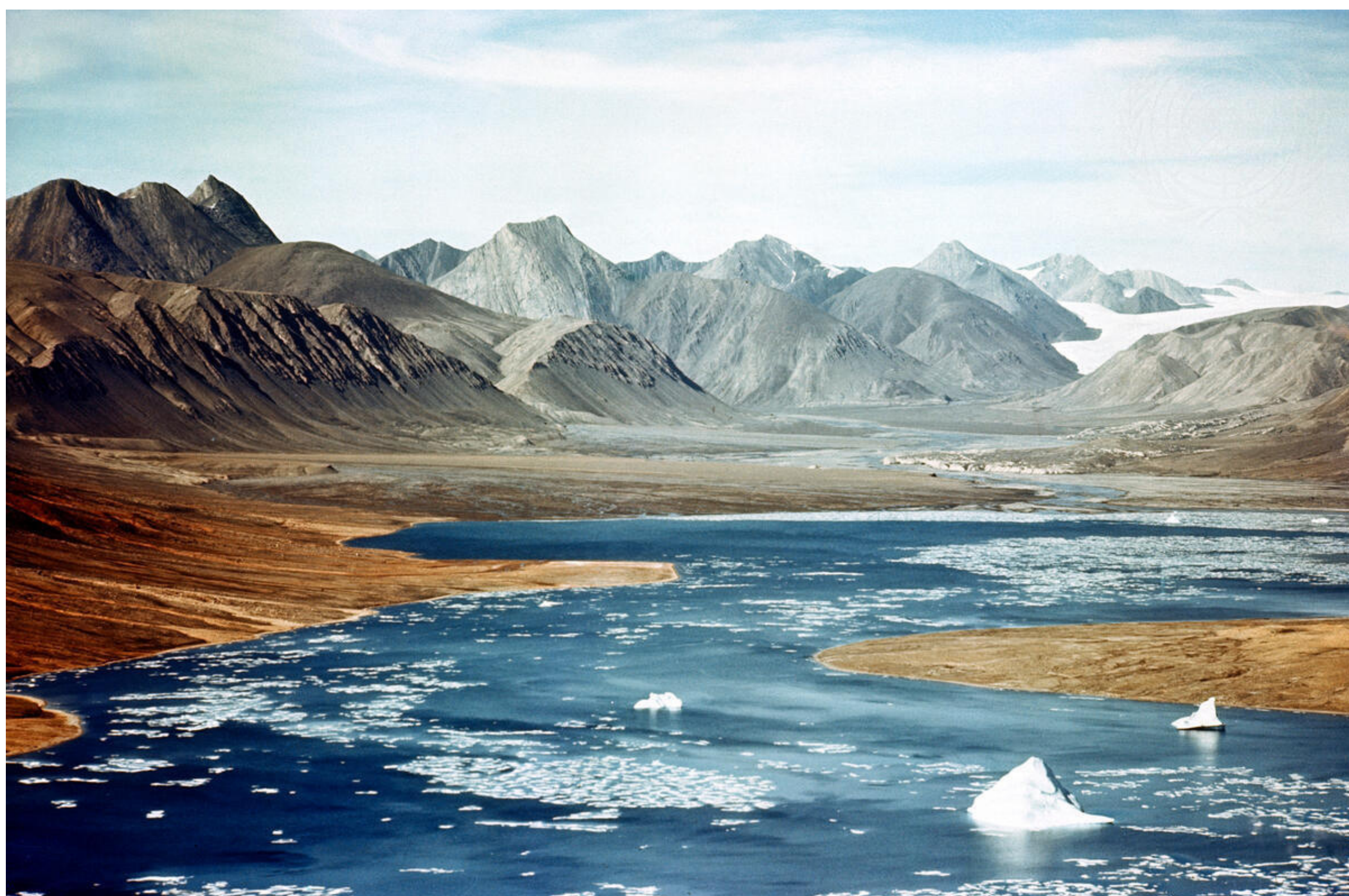
The Human Environment - New Challenge for the United Nations

HARNESSING CLIMATE & SDG SYNERGIES E-LEARNING COURSE