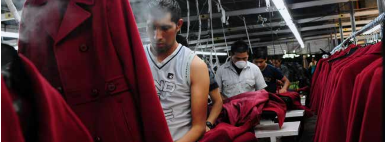
> Electricity powers a garment factory in Guatemala.