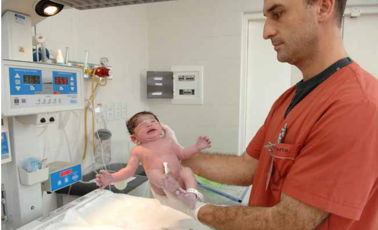
> Electricity powers critical health equipment to support delivery of newborn baby in Argentina.