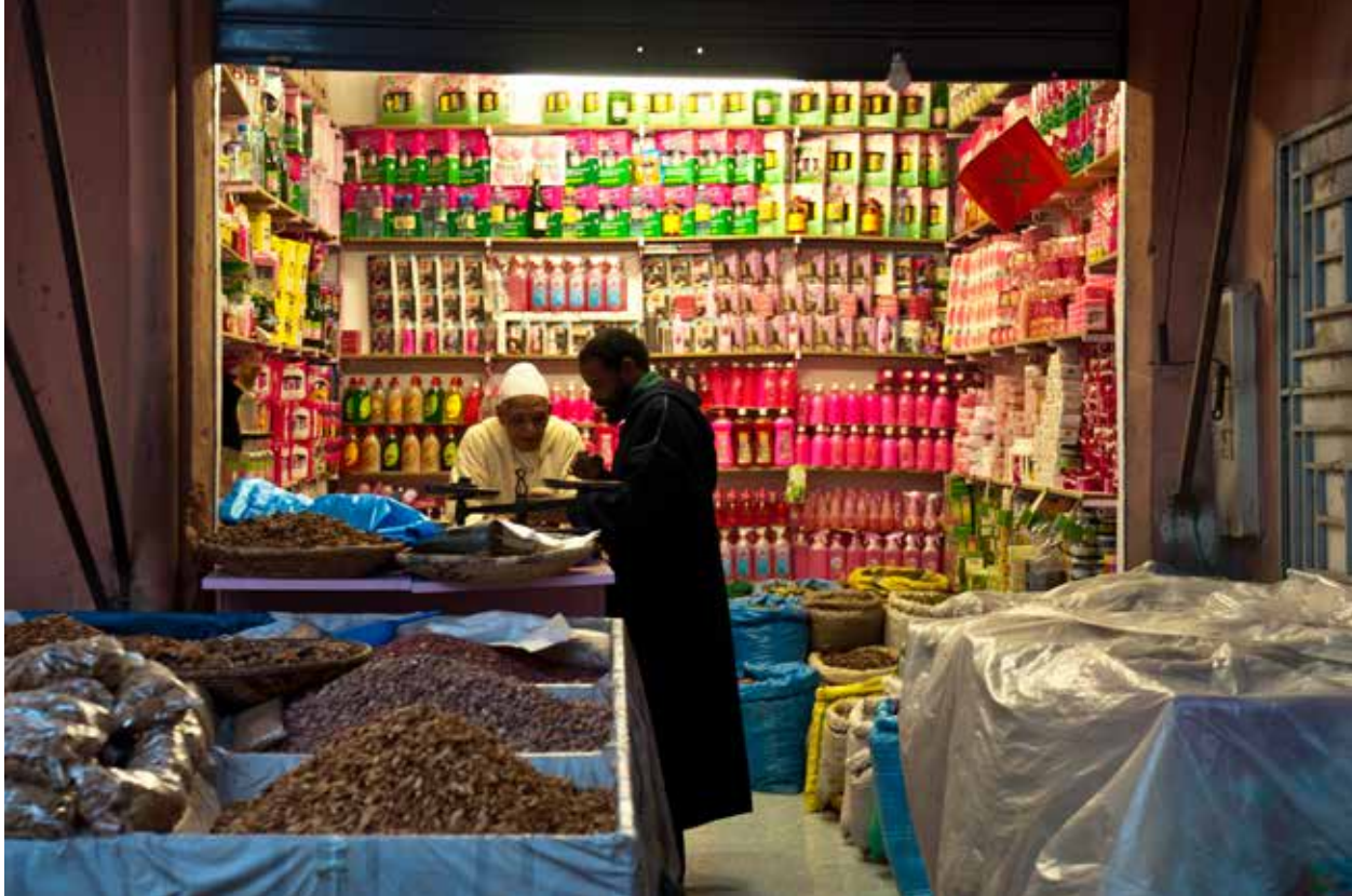
> Electric lighting supports evening commerce in Morocco.