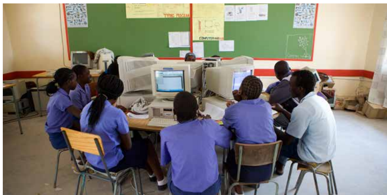
> Electricity use in classroom to support use of information technology in Namibia.

objective globally will depend critically on the progress that can be made in these countries. A third group of 20 high-income and emerging economies accounts for four-fifths of global energy consumption. Thus, the achievement of the global SE4ALL objectives for renewable energy and energy efficiency will not be possible without major progress in these high-impact countries.