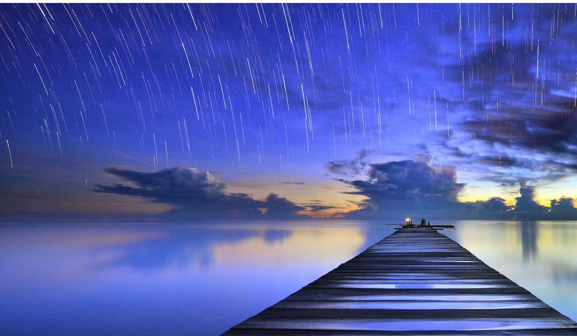
2018 Henrique Hioe 2nd Place Above Water Seascapes