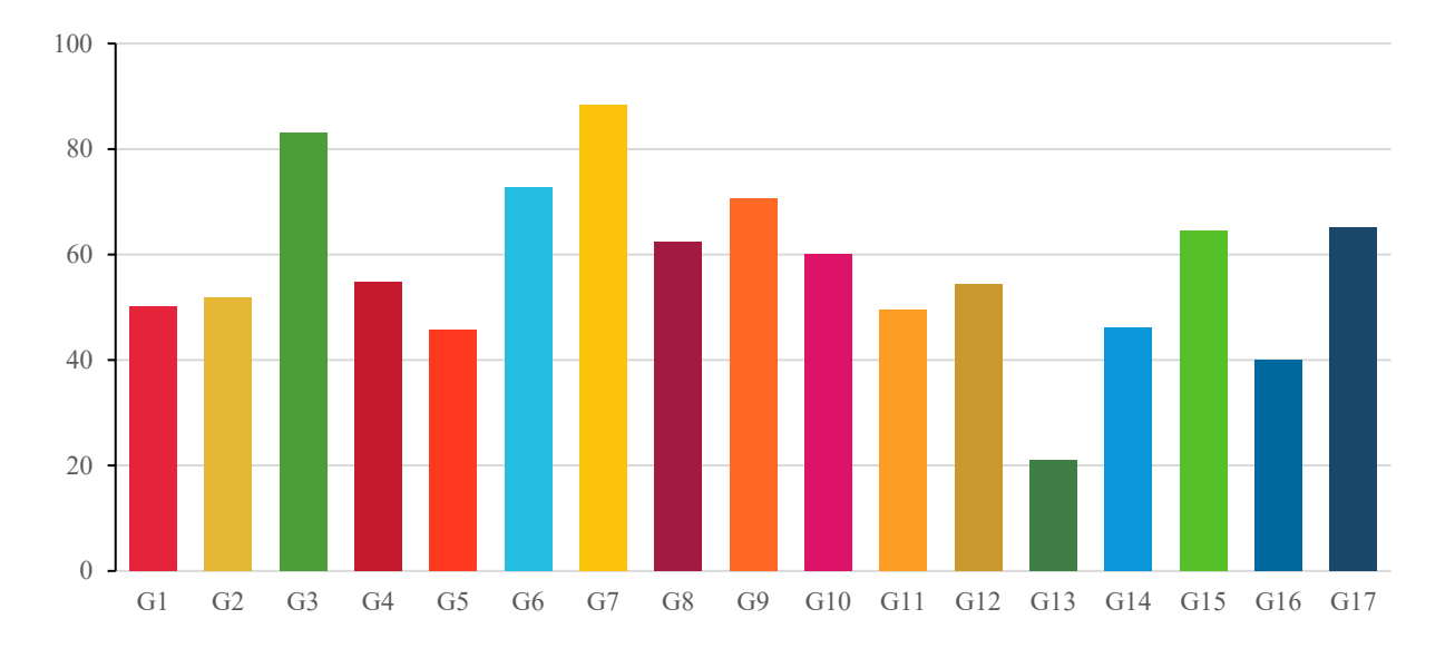
Proportion of countries or areas with available data since 2015, by Goal (percentage)